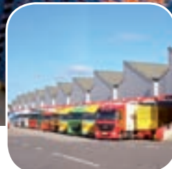
Forwarding to European client